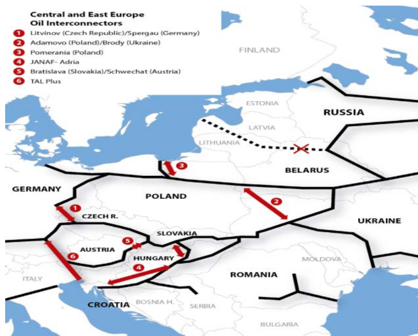
Map 6: Central and Eastern European Oil Interconnectors.