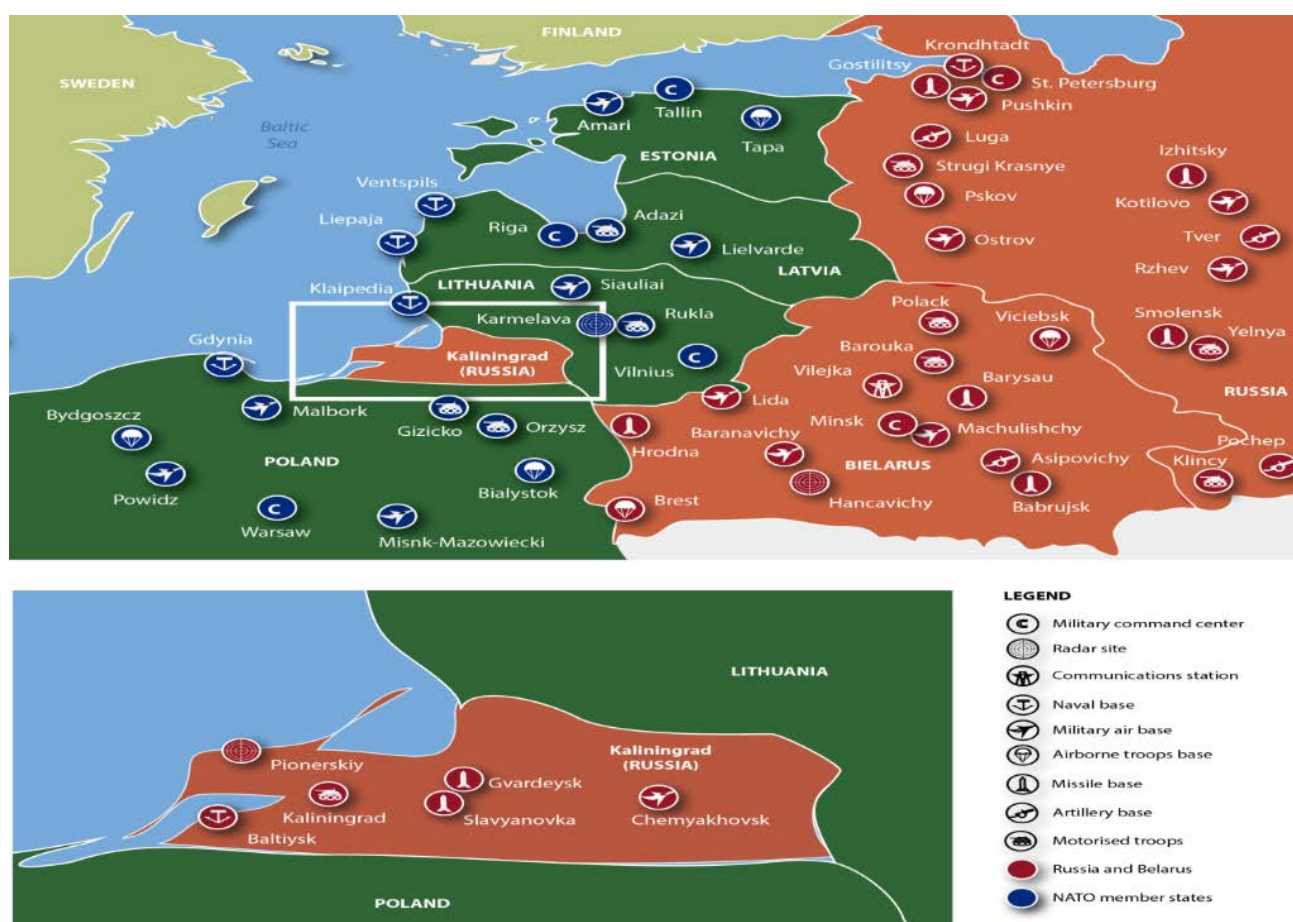
Map 3: Kaliningrad and major military installations in the Baltic Sea region.

The Ukraine crisis – especially after March 2015, when Russia officially abandoned the Treaty on Conventional Armed Forces in Europe (CFE) 17 – triggered a new wave of militarisation of the entire western flank with a special role allocated to Kaliningrad. Deployment of the most up-to-date military hardware such as the 'Iskander-M', the S-400 Triumf anti-aircraft weapon system, the Bastion-P and the 3K60 Bal coastal defence missile systems equipped with nuclear capability, and the P-800 Oniks supersonic anti-ship cruise missile led to Kaliningrad regaining its status as Russia's 'militarised fortress' and its most sophisticated Anti-Access/Area Denial (A2/AD) 'bubble' to date.