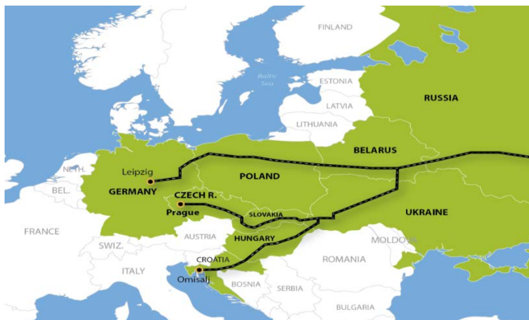
Map 5: The Soviet-era Druzhba Oil Pipeline System.

In 2015, according to the U.S. Energy Information Agency, 70% of Russian crude oil and condensates exports, close to 5.32 million barrels/day (mb/d), were directed to the EU and other European OECD states. Of these 5.32 mb/d only 0.732 mb/d, or merely 13.75% of total exports, were transited via the 54-year-old Druzhba oil pipelines to Poland (438,000 b/d), Slovakia (118,000 b/d), Hungary (98,000 b/d) and the Czech Republic (78,000 b/d). The Druzhba pipeline, Russia's principal oil export pipeline, is currently utilised at a rate of between 52%–61% of its existing transportation capacity of 1.2–1.4 mb/d. 67 The limited utilisation rate of the Druzhba pipeline does not necessarily pose a security risk for the four abovementioned eastern European states, which already have in place significant pipeline connections with alternative supplies in Germany through the IKL and Pomeranian pipelines to, respectively, the Czech Republic and Poland, as well as Croatia through the recently (2015) upgraded Janaf pipeline to Hungary and Slovakia.