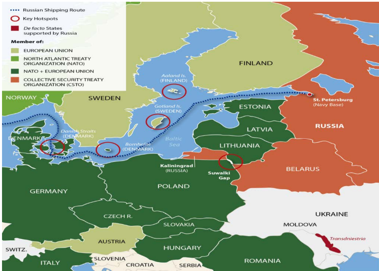
Map 2: The Baltic Sea region

The militarisation of the Kaliningrad Oblast reflects the Kremlin's desire to place the crisis with the EU in the military field, where, despite the risks, Moscow feels comfortable and has operational and political advantages over the EU states.